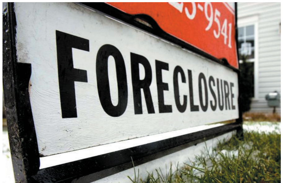
Time to foreclose on capitalism?

refused to bail out Lehman brothers, resulting in one of the biggest bankruptcies in US history. The collapse occurred after talks with a potential buyer, South Korean state-controlled Korea Development Bank, fell through. Yet as recently as December 2005, the International Financing Review said that Lehman Brothers had "not only maintained its overall market presence, but also led the charge into the preferred space by . . . developing new products and tailoring transactions to fit borrowers' needs. . . Lehman Brothers is the most innovative in the preferred space, just doing things you won't see elsewhere." Innovative it may have been, but resting on firm foundations it clearly was not.