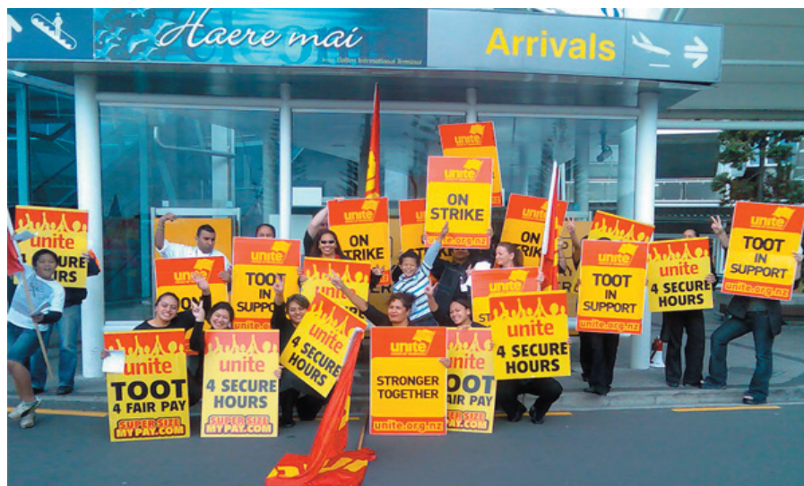
Under capitalism, workers are always forced to fight for even crumbs; we need to take possession of the whole cake

In the past two decades we've had the stock market crash of 1987, the 1990 junk bond market crash, along with a savings and loans crisis in the US, the 1994 US bond